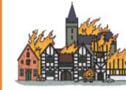
Mid Sunday morning

As news of the fire spreads, people run to escape from its path.